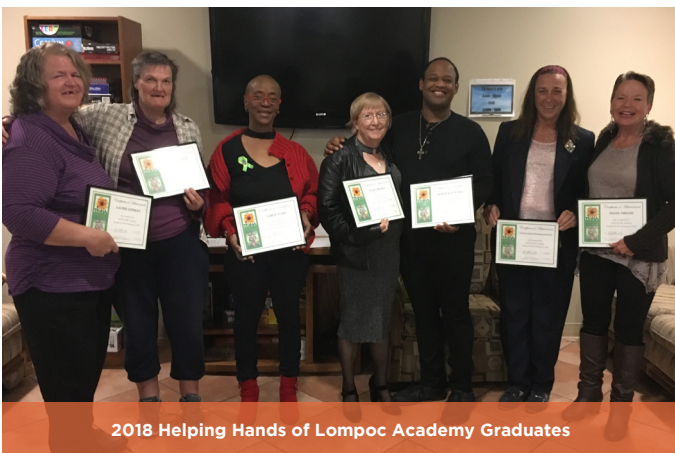
2018 Helping Hands of Lompoc Academy Graduates